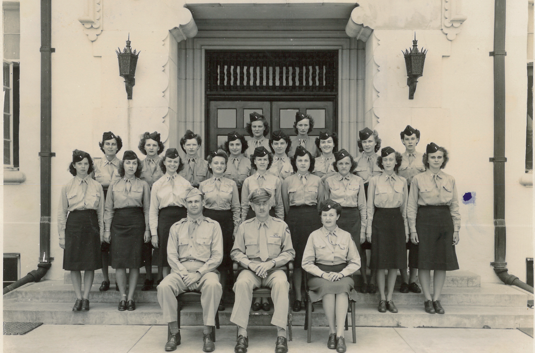
G 232 26 JUL 45 A AF 27 BU AAFSAM MAES FLIGHT NURSES CLASS J. R.F.T.